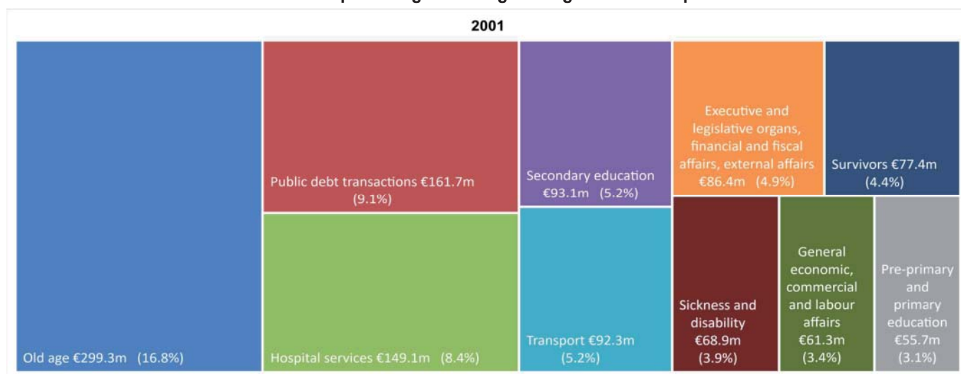
Chart 2. A treemap of the top 10 government expenditure groups for 2001 and 2016 in nominal and percentage of total general government expenditure