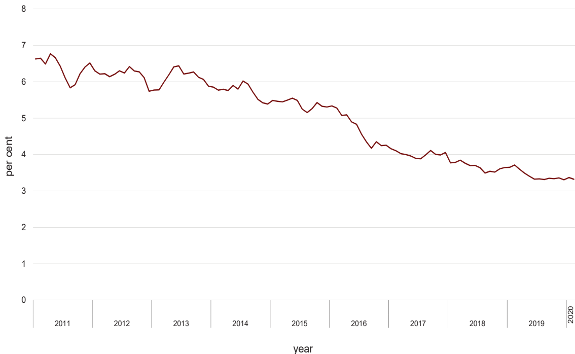
Chart 1. Seasonally adjusted monthly unemployment rate