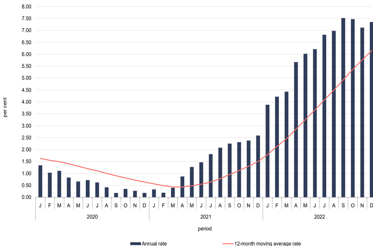
Chart 1. Inflation rates