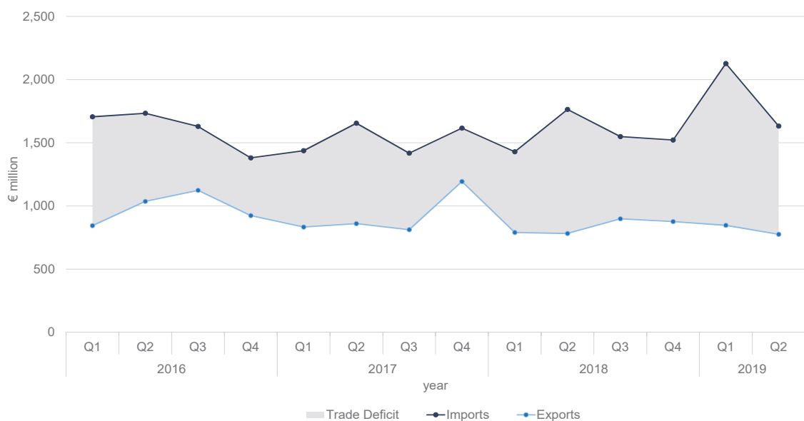
Chart 1. International Trade in Goods - quarterly

For the same reference period, imports from the European Union reached €2,516.5 million, or 67.0 per cent of total imports. There was a decrease of €367.8 million in imports from euro area countries when compared to the same period in 2018. Main increases and decreases in imports were registered from the United Kingdom (€774.4 million) and Italy (€204.1 million) respectively. With respect to exports, the main increase was directed to Spain (€31.8 million), whereas Italy (€21.9 million) registered the highest decrease (Table 3) ■