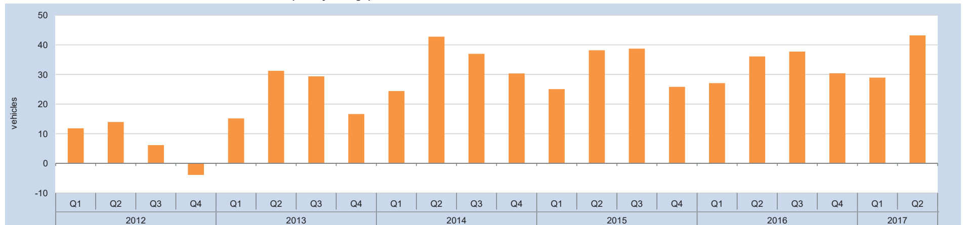
Chart 2. Net increase/decrease in stock of licensed vehicles per day during quarter: 2012-2017