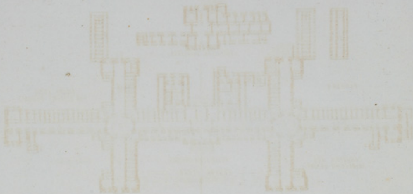
PLAN OF THE