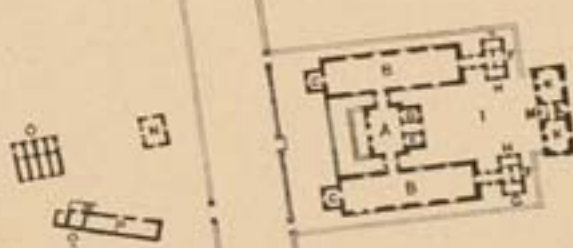
AGRICULTURAL COLONY BUILDINGS