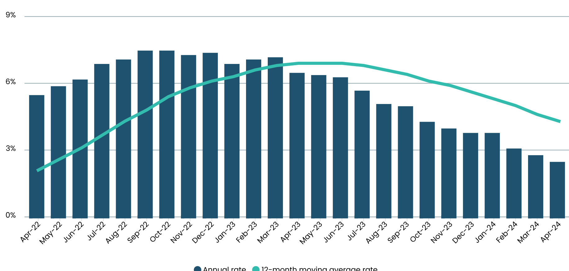
Chart 1. Inflation rates

In April 2024, the largest upward contribution to the overall annual inflation was registered in the Food and non-alcoholic beverages Index (+0.93 percentage points), largely due to higher prices of milk. The second and third largest contributions were measured in the Restaurants and hotels Index (+0.61 percentage points) and the Miscellaneous goods and services Index (+0.36 percentage points), mainly on account of higher prices of restaurant services and articles for personal hygiene, respectively.