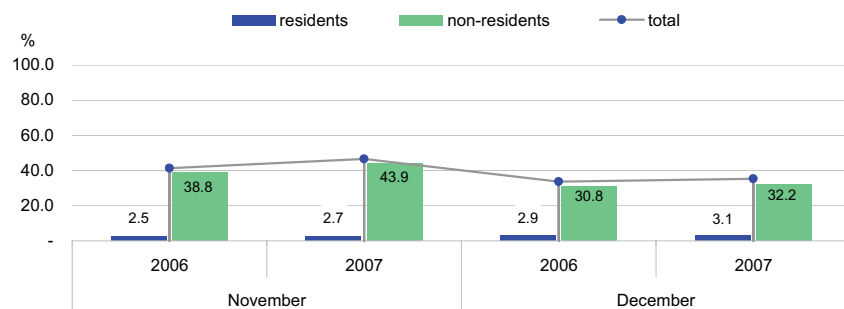
Chart 1. Net occupancy rates in collective accommodation establishments: November-December

The overall occupancy rate in collective accommodation establishments (net use) went up by 1.6 percentage points in December 2007 when compared to the same month a year earlier, to stand at 35.3 per cent (see Tables 5 and 7).