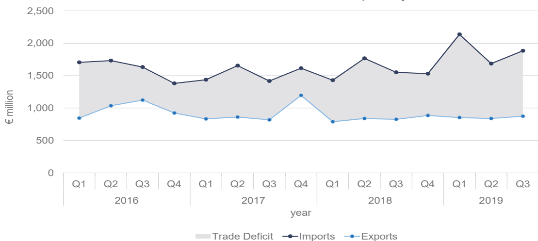
Chart 1. International Trade in Goods - quarterly

For the same reference period, imports from the European Union reached €3,856.7 million, or 67.6 per cent of total imports. There was a decrease of €378.3 million in imports from euro area countries when compared to the same period in 2018. Main increases and decreases in imports were registered from the United Kingdom (€855.4 million) and Italy (€257.5 million) respectively. With respect to exports, the main increase was directed to Spain (€30.6 million), whereas Libya (€90.6 million) registered the highest decrease (Table 3) ■