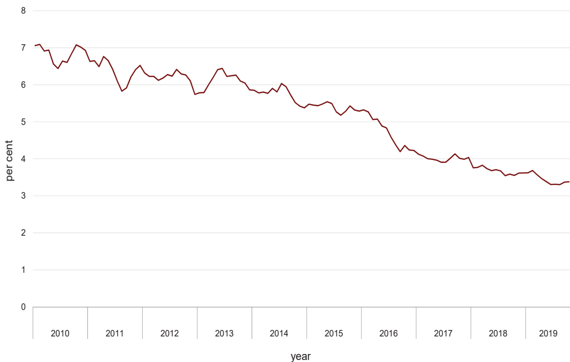
Chart 1. Seasonally adjusted monthly unemployment rate