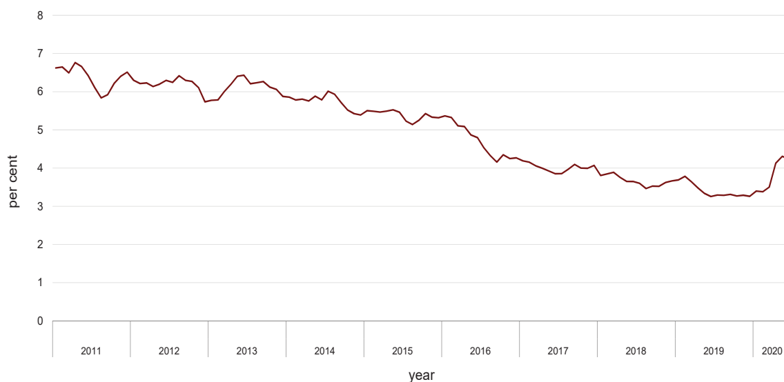
Chart 1. Seasonally adjusted monthly unemployment rate

Note: Data for reference years 2010-2019 is on an annual basis; data for reference year 2020 is from January to June.