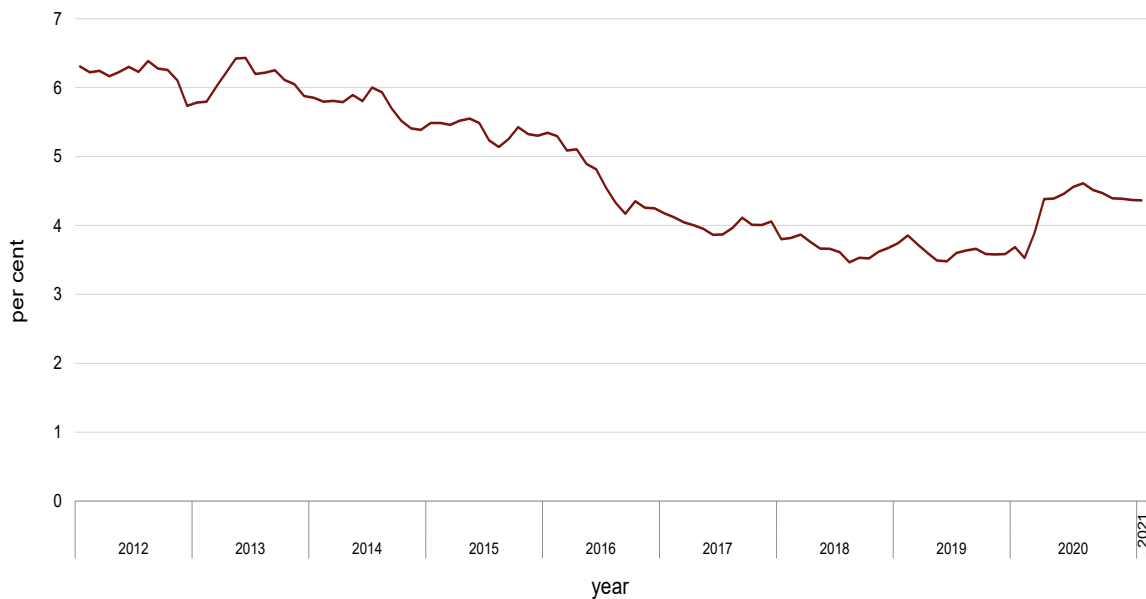
Chart 1. Seasonally adjusted monthly unemployment rate

Statistics in this News Release should be interpreted in the context of the COVID-19 situation.