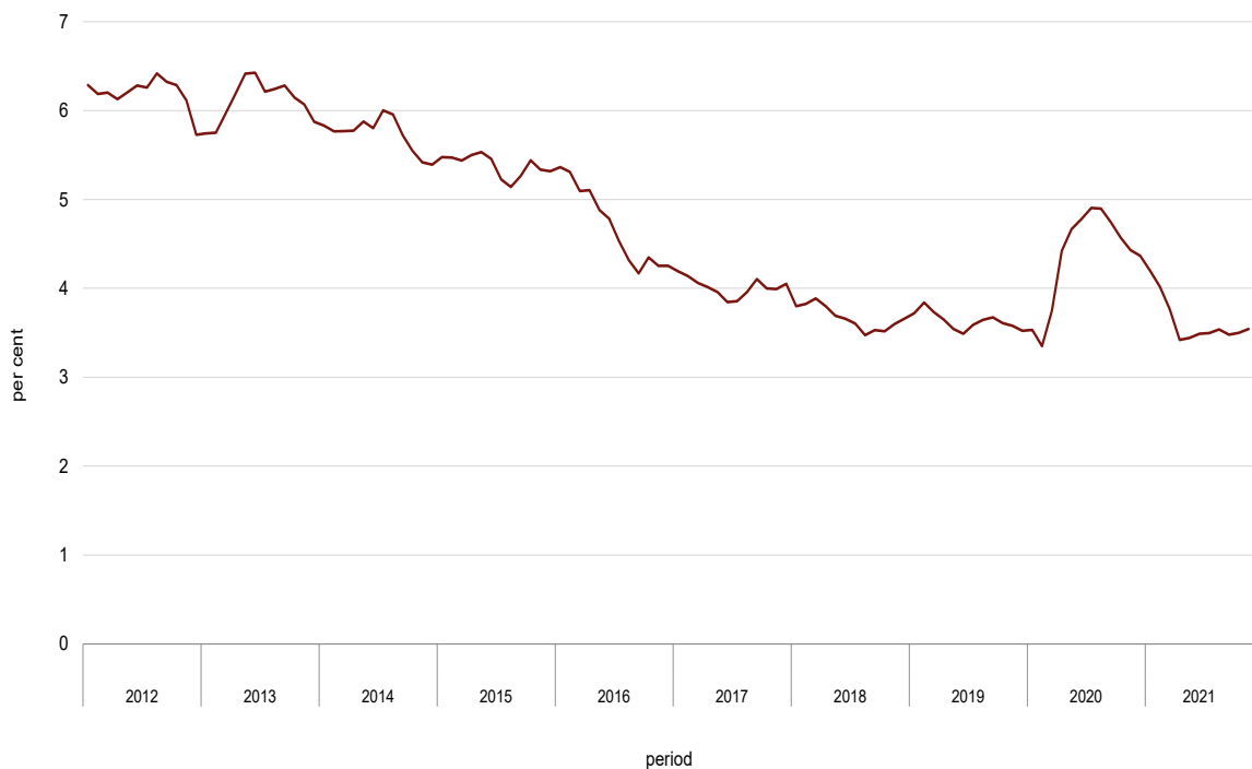
Chart 1. Seasonally adjusted monthly unemployment rate

Note: Data for reference years 2012-2020 is on annual basis; data for reference year 2021 is from January to November.