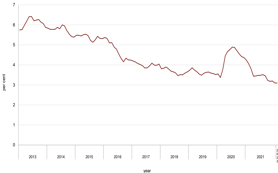
Chart 1. Seasonally adjusted monthly unemployment rate

Note: Data for reference years 2013-2021 is on annual basis; data for reference year 2022 is for January to February.