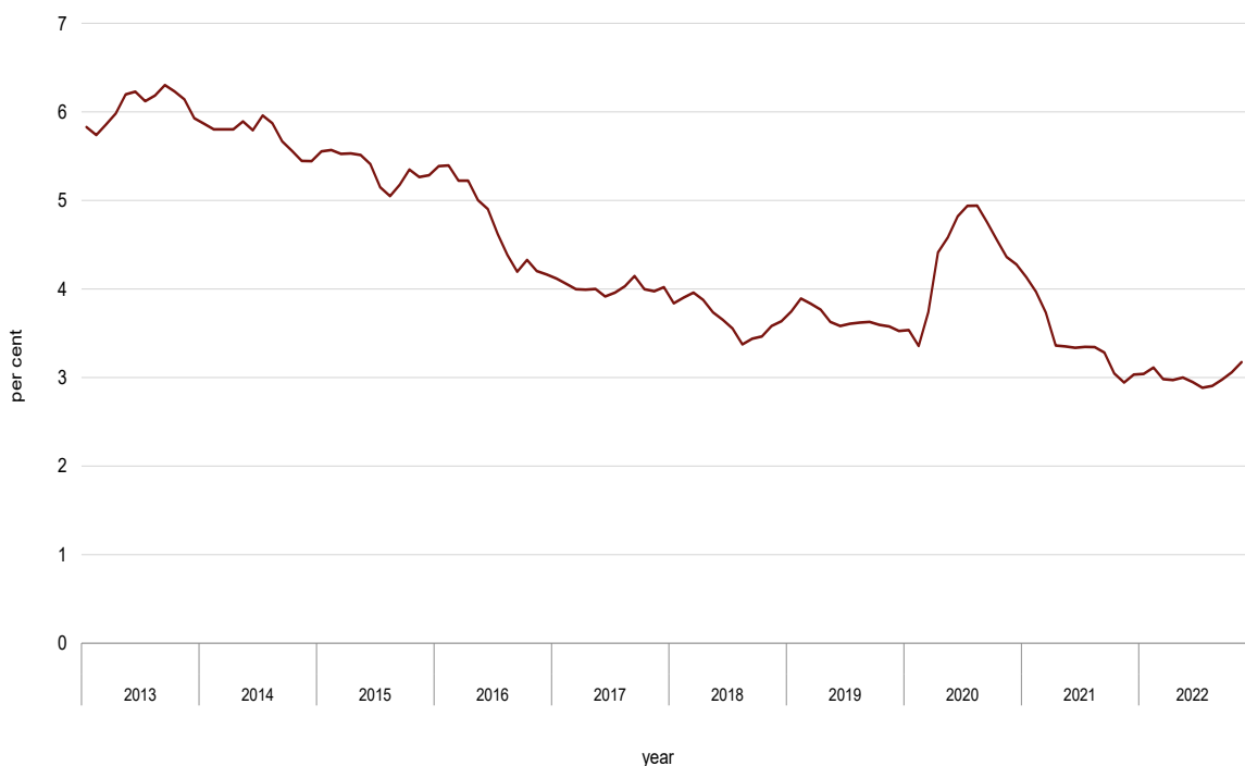
Chart 1. Seasonally adjusted monthly unemployment rate

Note: Data for reference years 2013-2021 is on annual basis; data for reference year 2022 is for January to November.