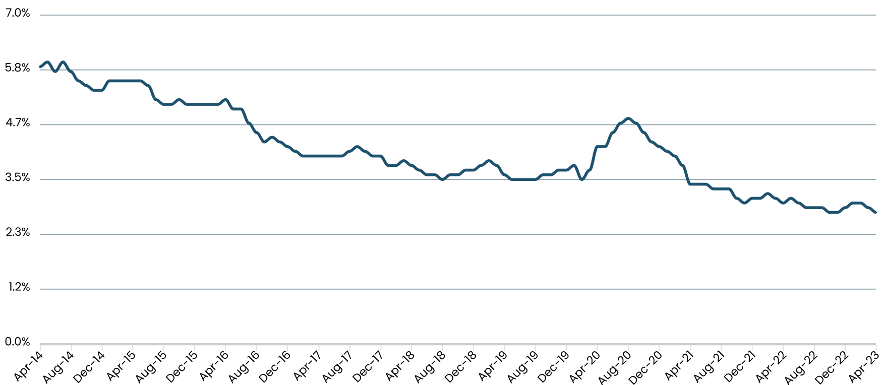
Chart 1. Seasonally adjusted monthly unemployment rate

For April 2023, the unemployment rate for males stood at 3.1 per cent, decreasing by 0.1 percentage points when compared with the previous month. Meanwhile, the rate for females stood at 2.5 per cent, dropping by 0.1 percentage points from March 2023 (Table 1).