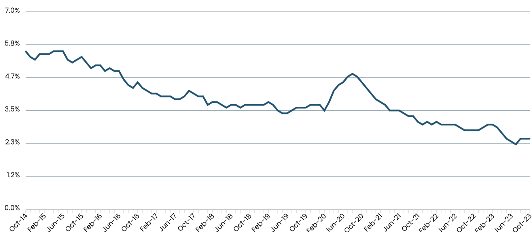
Chart 1. Seasonally adjusted monthly unemployment rate

For October 2023, the unemployment rate for males stood at 2.4 per cent, decreasing by 0.1 percentage points when compared with the previous month. Meanwhile, the rate for females stood at 2.6 per cent, at par with September 2023 (Table 1).